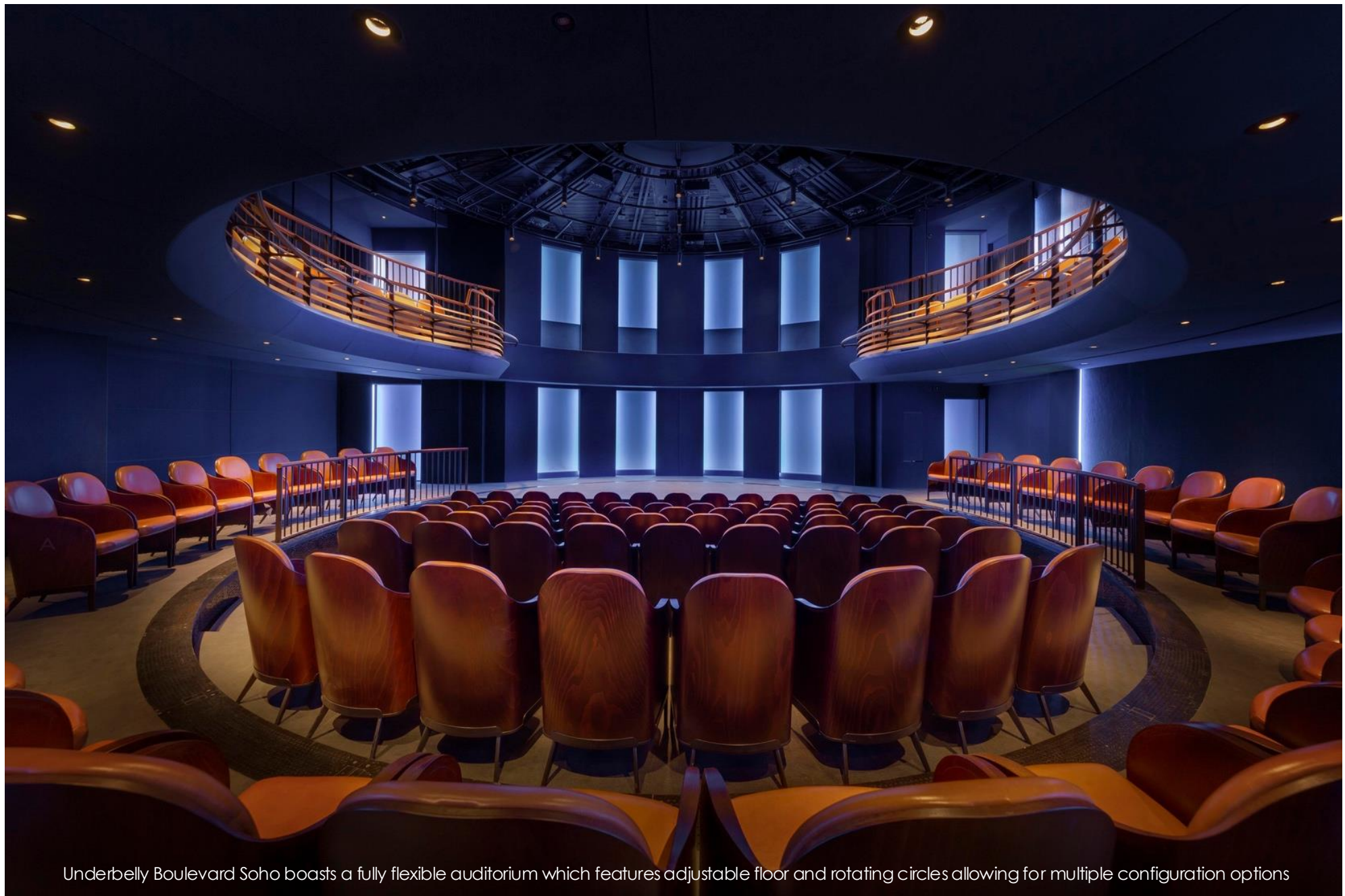
Underbelly Boulevard Soho boasts a fully flexible auditorium which features adjustable floor and rotating circles allowing for multiple configuration options