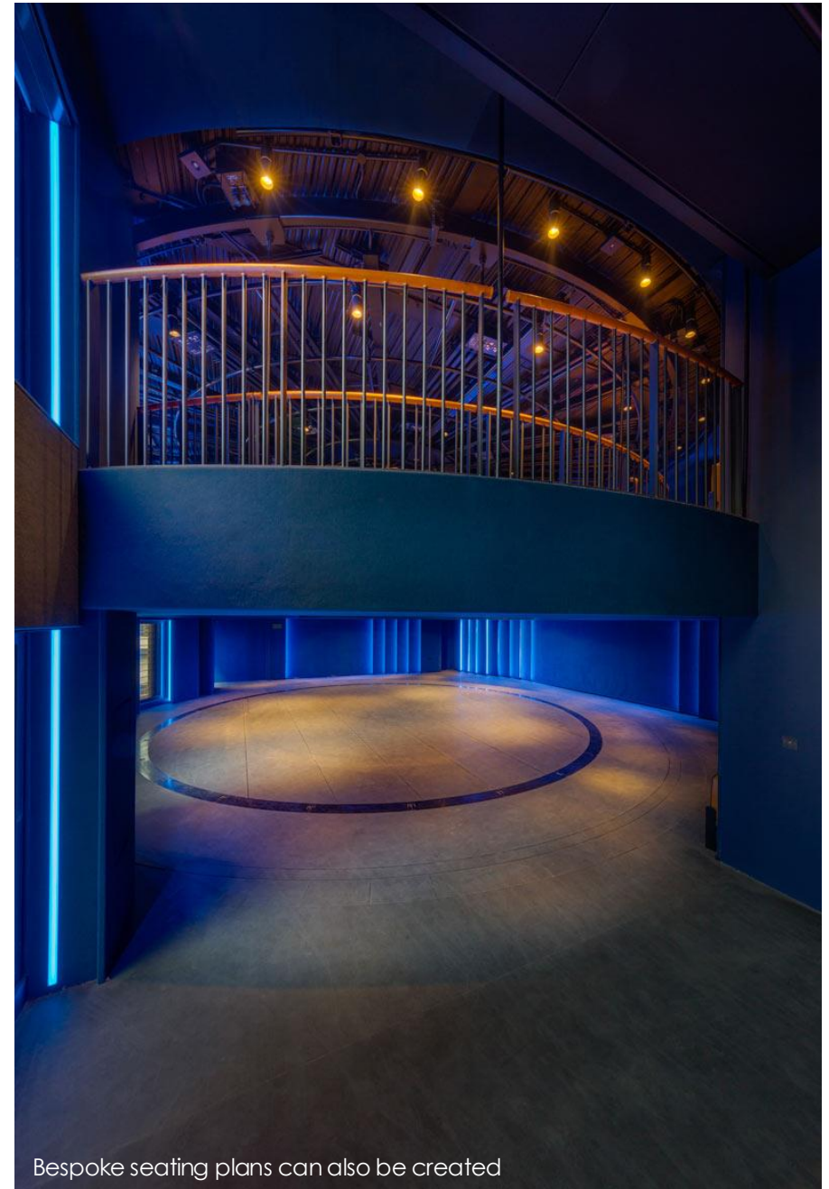
Bespoke seating plans can also be created