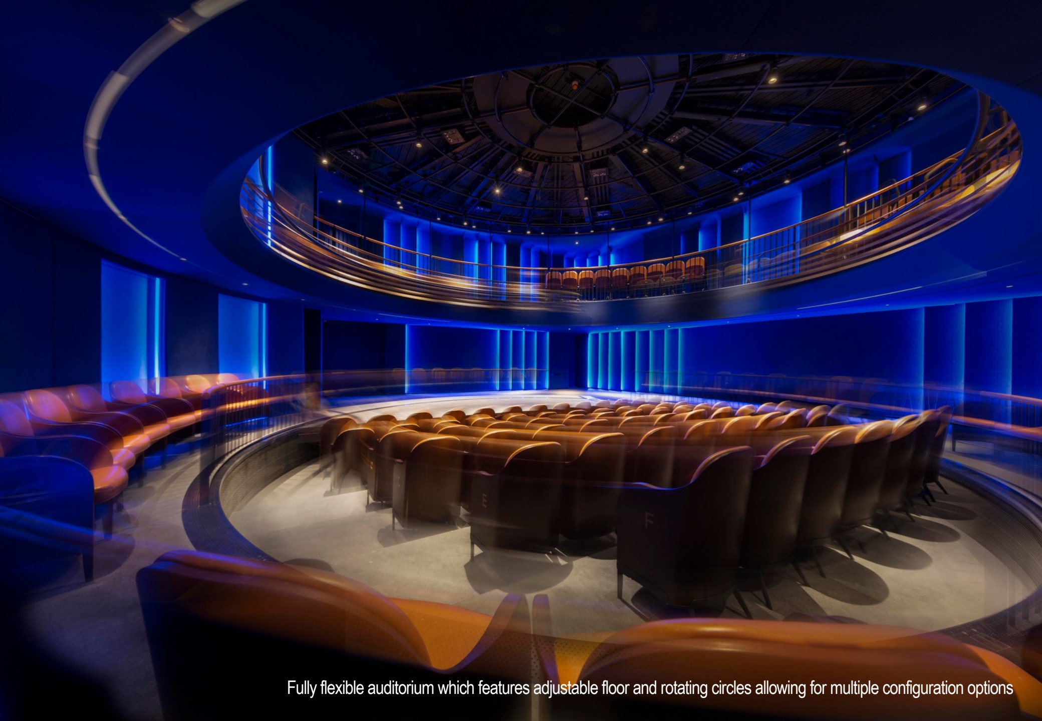
Fully flexible auditorium which features adjustable floor and rotating circles allowing for multiple configuration options